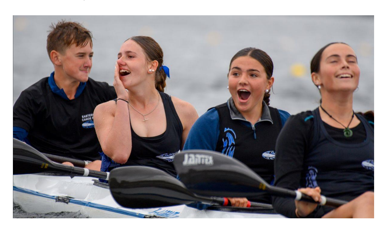
Proudly run in collaboration with Waka Ama NZ