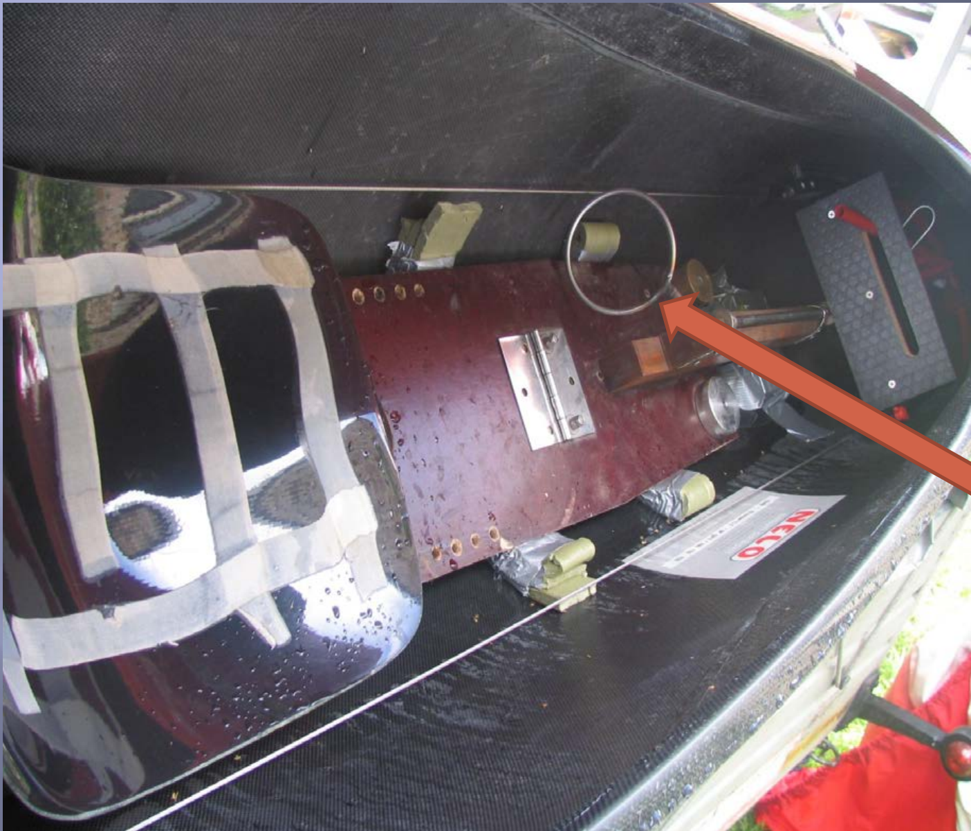
The rudder adapted for leg amputees